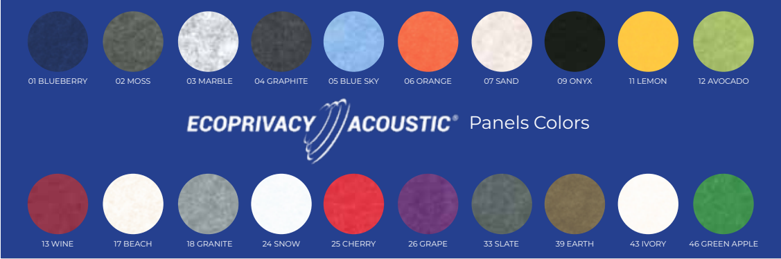
EcoPrivacy Acoustic® / Creo / Weave