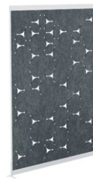
Addo Air (Large) (66"H x 48" W)

Addo Air can be cut to fit almost any custom size you need!