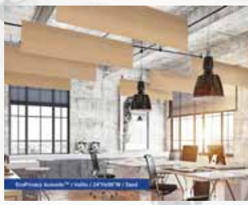
Volito EA VO 28 Size 28 - 24"Hx96"W

Multiple colors make your walls and dividers come alive with movement and dimension. Provide a soothing space, or spike the energy for productivity.