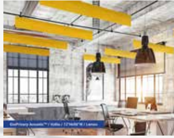
Volito EA VO 18 Size 18 - 12"Hx96"W