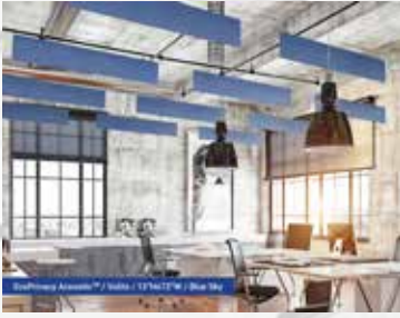
Volito EA VO 16 Size 16 - 12"Hx72"W