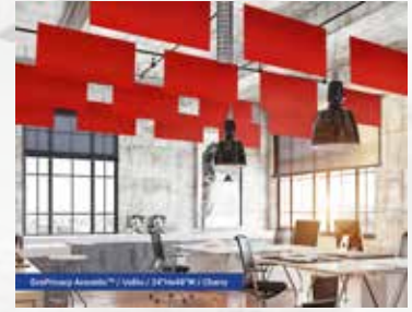
Volito EA VO 24 Size 24 - 24"Hx48"W