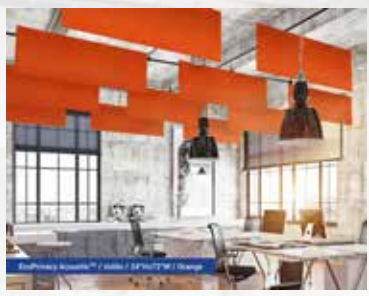
Volito EA VO 26 Size 26 - 24"Hx72"W