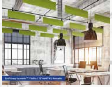
Volito EA VO 14 Size 14 - 12"Hx48"W